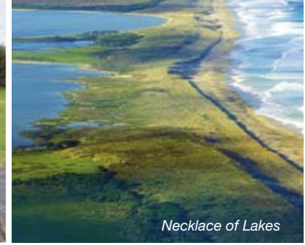
Necklace of Lakes